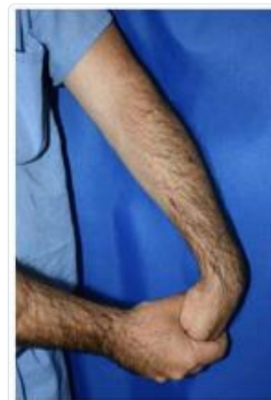
Wrist stretching exercise with elbow extended.

Extracorporeal shock wave therapy. Shock wave therapy sends sound waves to the elbow. These sound waves create "microtrauma" that promote the body's natural healing processes. Shock wave therapy is considered experimental by many doctors, but some sources show it can be effective.