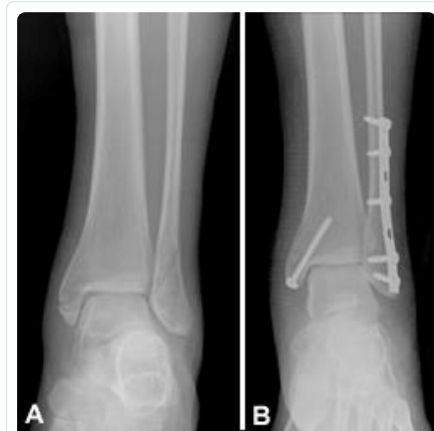
(Left) X-ray of bimalleolar ankle fracture. (Right) Surgical repair bimalleolar ankle fracture.