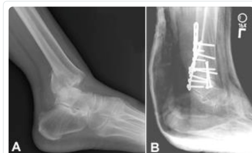
(Left) X-ray of trimalleolar ankle fracture. (Right) Surgical repair.

Each fracture can be treated with the same surgical techniques as written above for each individual fracture.