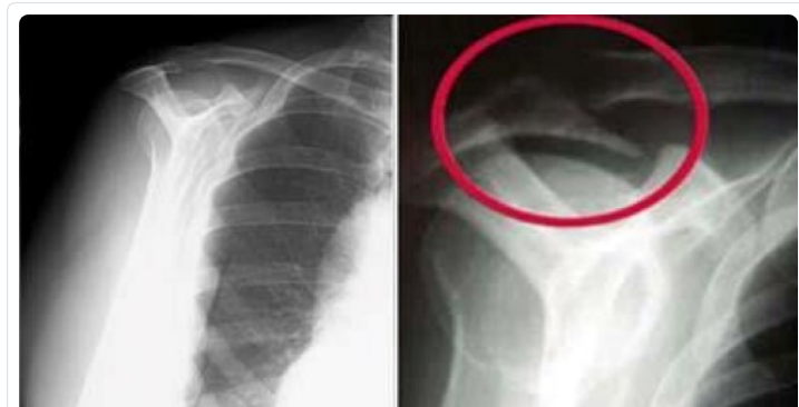
(Left) Normal outlet view x-ray. (Right) Abnormal outlet view showing a large bone spur causing impingement on the rotator cuff.

X-rays. Because x-rays do not show the soft tissues of your shoulder like the rotator cuff, plain x-rays of a shoulder with rotator cuff pain are usually normal or may show a small bone spur. A special x-ray view, called an "outlet view," sometimes will show a small bone spur on the front edge of the acromion.